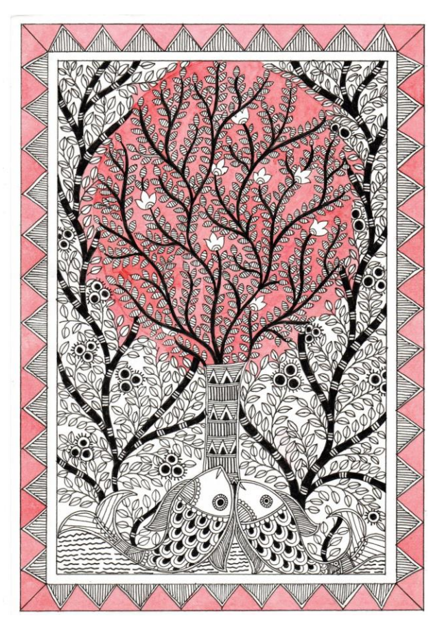
Madhubani Painting (Tree of Life)